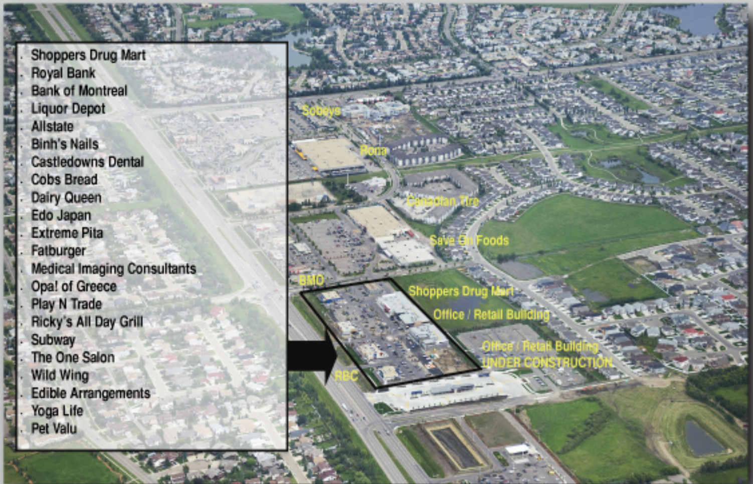
Aerial Photograph of Namao Centre South Site, in North Edmonton, Alberta, south of 160th Avenue at 97th Street.